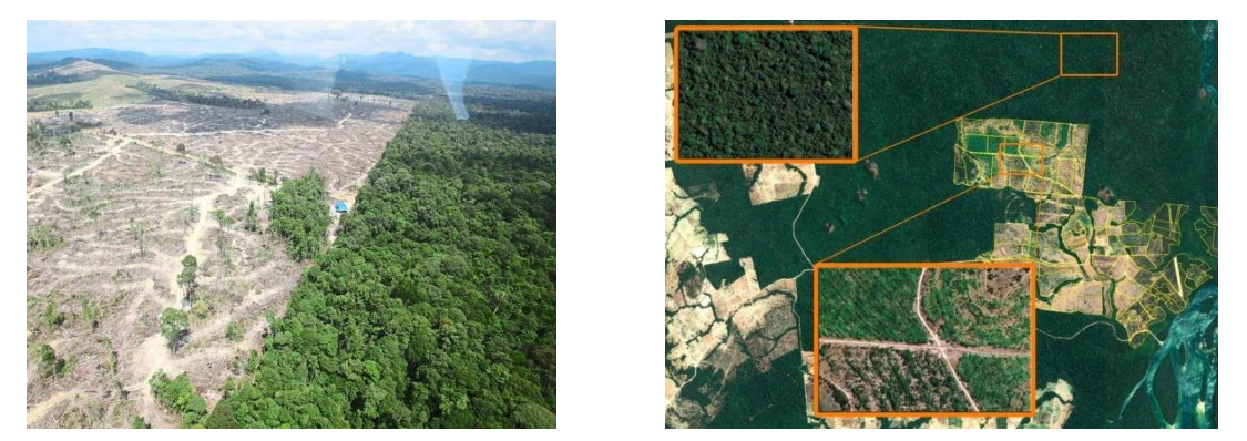
Satellite imagery assists researchers in tracking changes in forest cover

Anthropogenic activities and natural calamities are the principle forces accounting for reduced forest covers across the world. The worst face of anthropogenic influence witnessed in this century is deforestation. These changes act on climate through both biogeochemical and biophysical processes and contribute to climate change. Hence it is necessary to understand the impact of large-scale deforestation on local climate, which in turn will affect the global food production. For the first time, a high-resolution NASA global satellite data was used to predict the changes in local temperature which are influenced by deforestation and land use patterns. The researchers used satellite data from the Moderate resolution Imaging Spectroradiometer (MODIS) to observe the biophysical impact of forests on local temperature at a global coverage to explore the controlling mechanisms. The work is a result of combined effort of researchers from United States and China, headed by Dr. Yan Li of Peking University. Their findings were recently published in the journal Nature Communications.